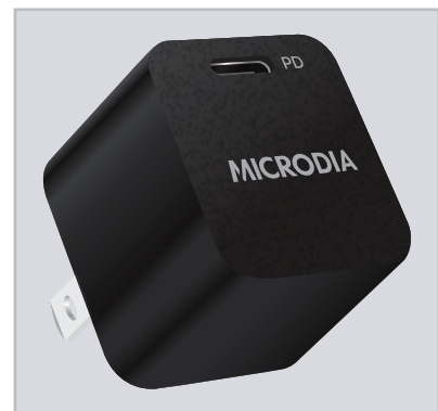
X.CUBE 18W PD USB-C Wall Charger