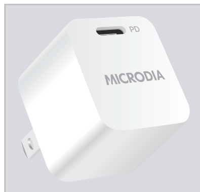
X.CUBE 18W PD USB-C Wall Charger